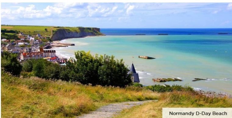
Normandy D-Day Beach