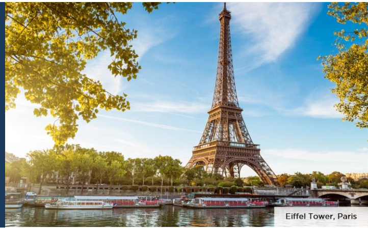
Eiffel Tower, Paris

7-night cruise from Paris to Paris July 10-17, 2025 | AmaLyra