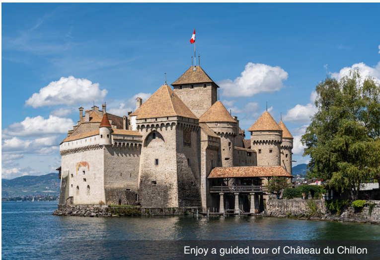
Enjoy a guided tour of Château du Chillon

During free time, walk along the Brunnengasse, a street that earned the title of “the most beautiful street in Europe”, and home to many 18th-century houses with wood-carved embellishments. Return by coach to the hotel with the remainder of the day at leisure. Meal: B