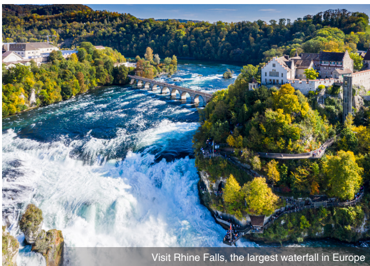
Visit Rhine Falls, the largest waterfall in Europe