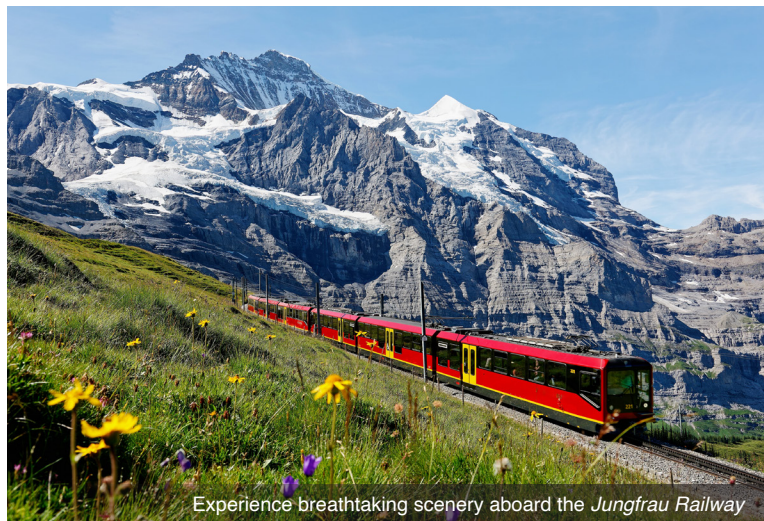
Experience breathtaking scenery aboard the Jungfrau Railway

DAY 1 Depart the USA: Depart the USA on your overnight flight to Zurich, Switzerland.