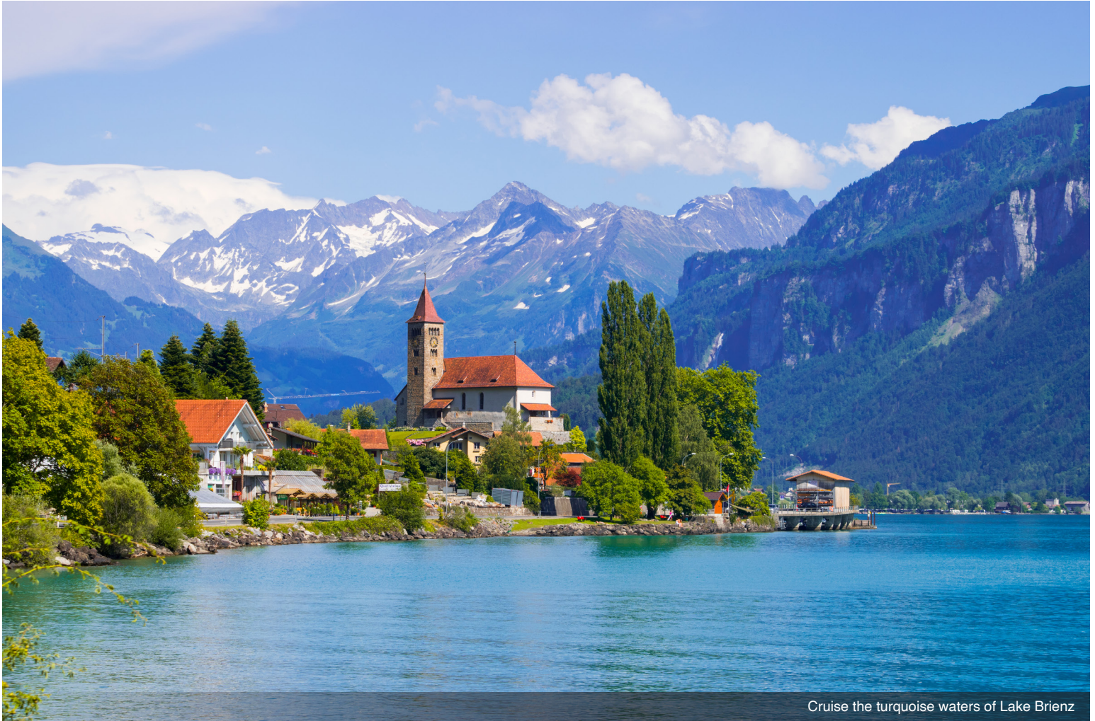
Cruise the turquoise waters of Lake Brienz